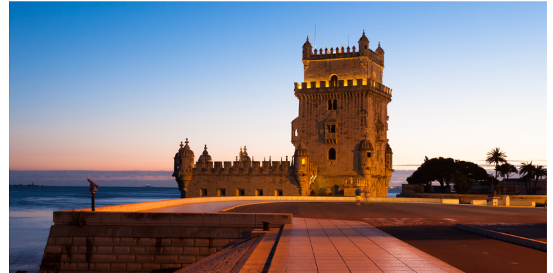
Belém Tower, Lisbon

Don't miss out on the rich cultural and historical heritage of Portugal, one of the oldest countries in Europe.