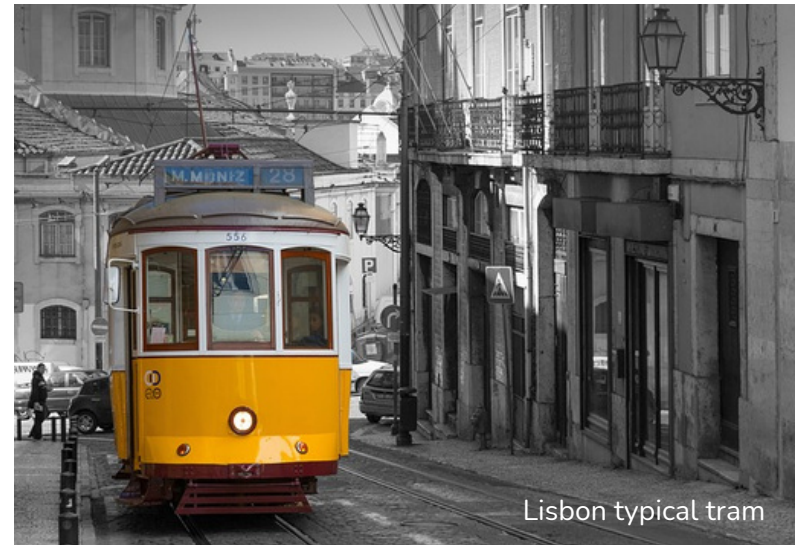
Lisbon typical tram