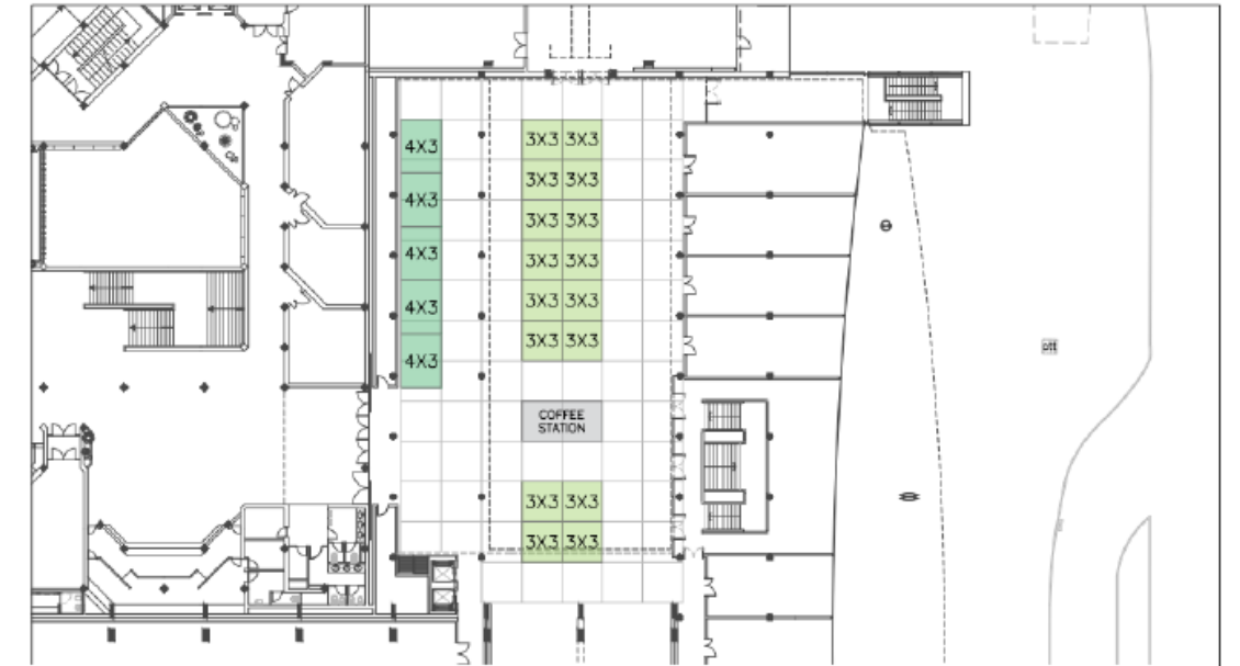
Figure 2-Exhibition Area at Pavilion 4